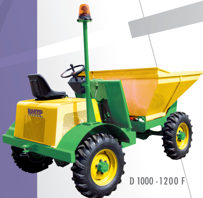
D 1000 - 1200 F