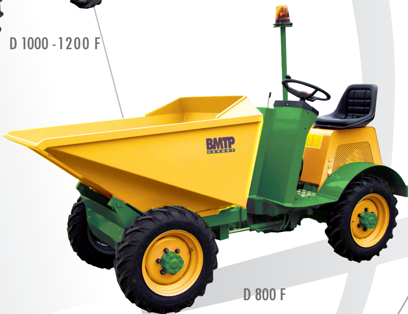
D 800 F

SCARICO IDRAULICO FRONTALE DESCHARGEMENT HYDRAULIQUE FRONTAL HYDRAULIC FRONTAL TIPPING DESCARGA HIDRAULICA FRONTAL